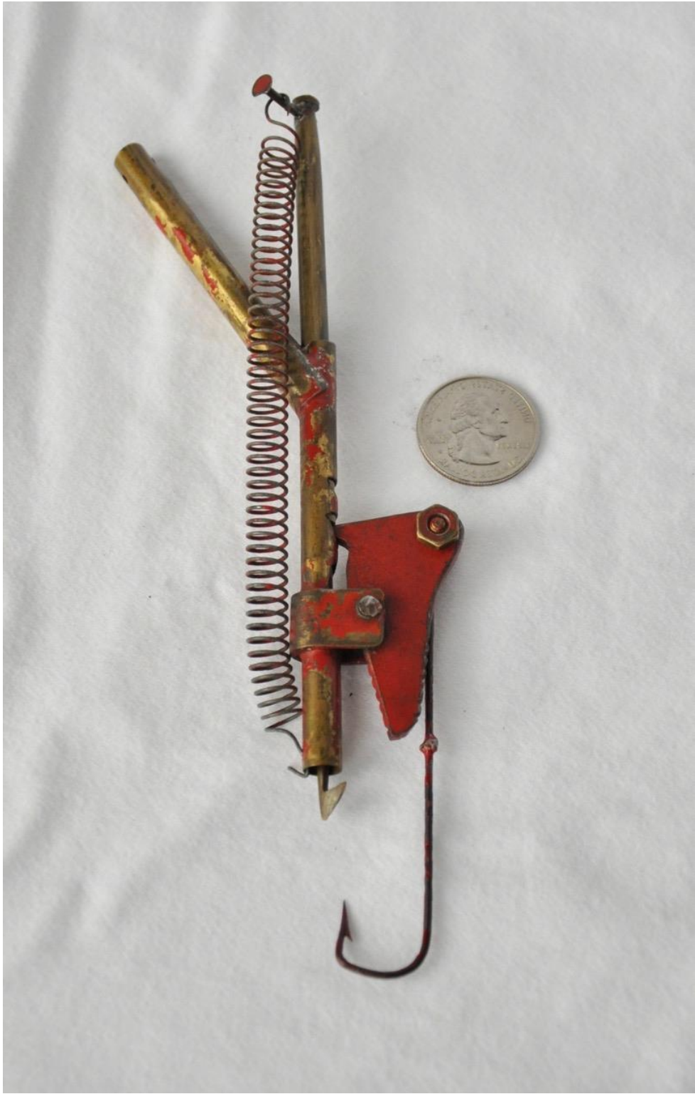
note quarter for scale