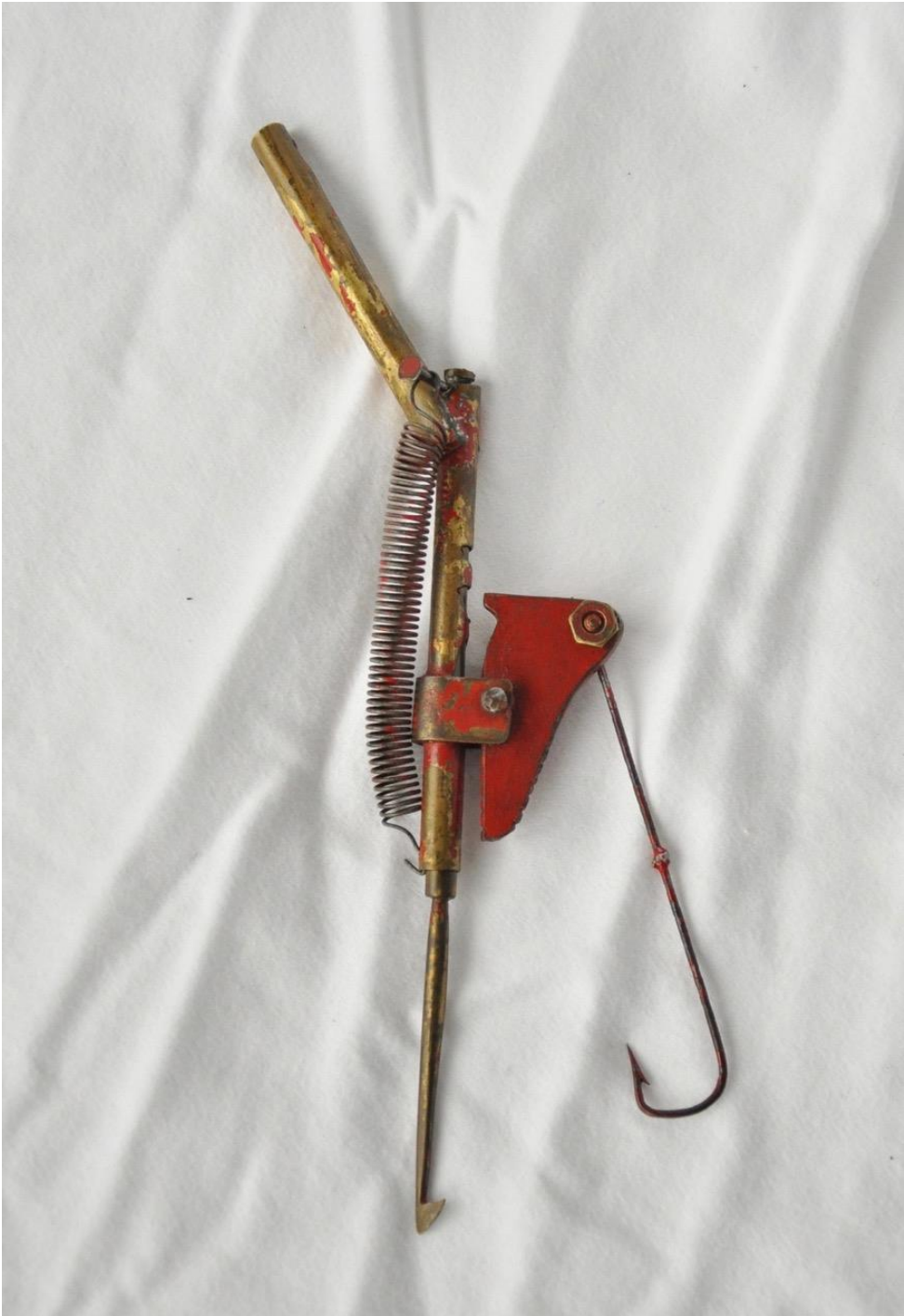
Shown in the Sprung Position