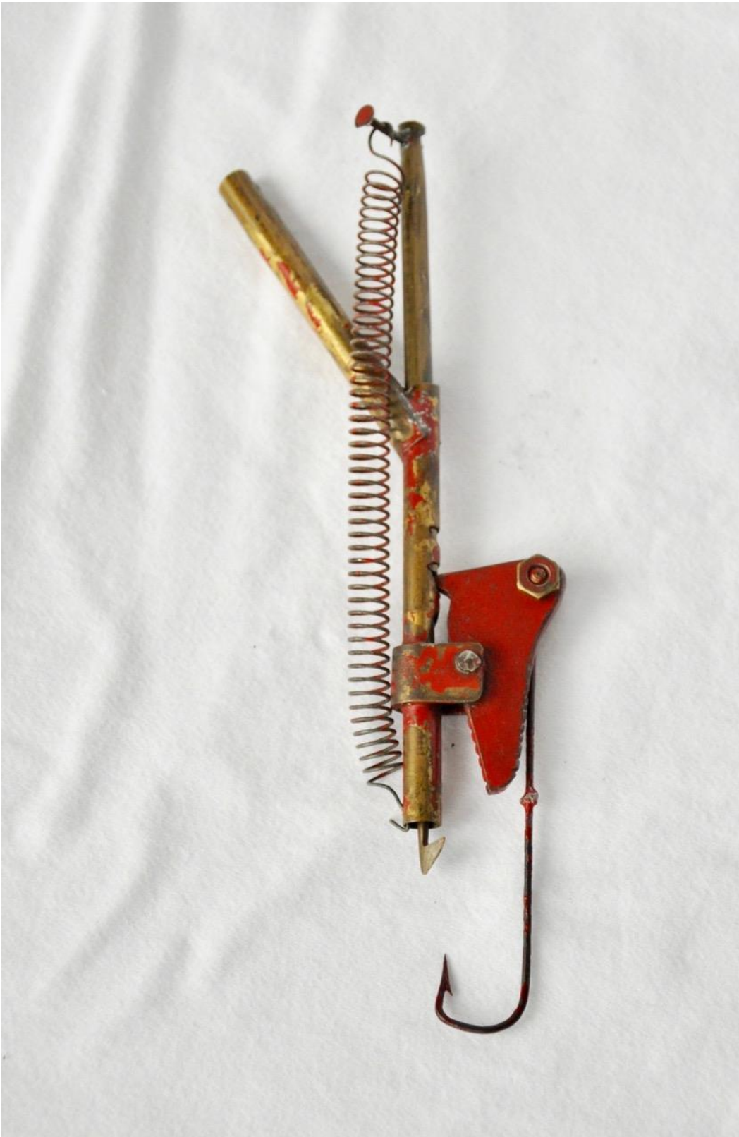
Shown in the set position.